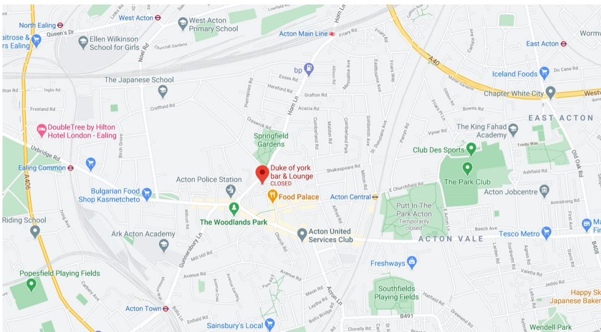
Not to scale - Provided for indicative purposes